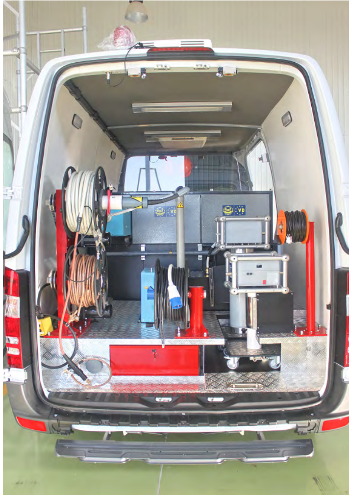
View of the Technical area

for carrying out testing and inspections. Safety is an important feature of the test vans and hence all equipment is properly mounted and secured for transit. The operator compartment provides a pleasant environment to work in with more room and plenty of storage. It is equipped with cabinetry and workbenches that increase the operators' efficiency and productivity.