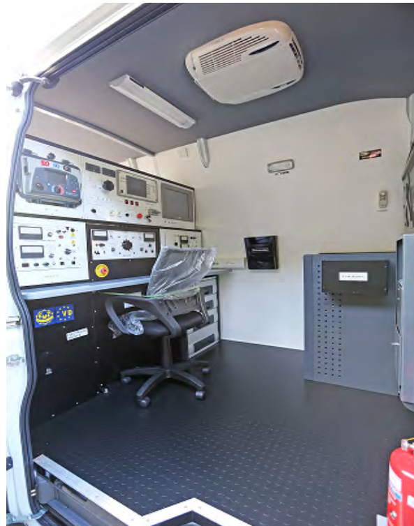
View of the Operator area